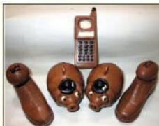
ANIMALS, BIRDS, NOVELTIES & SPORTING